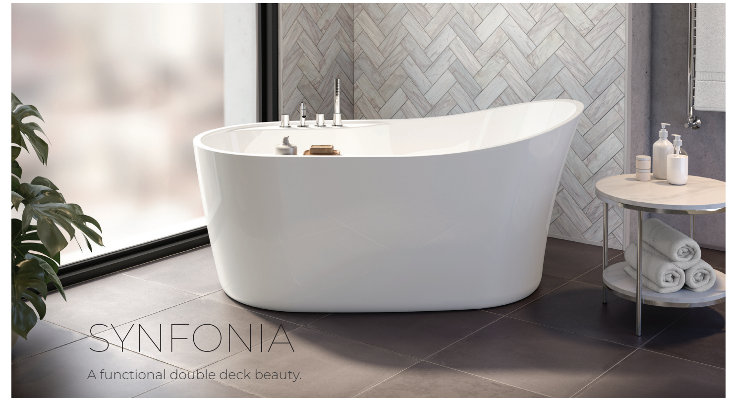
SYNFONIA A functional double deck beauty.