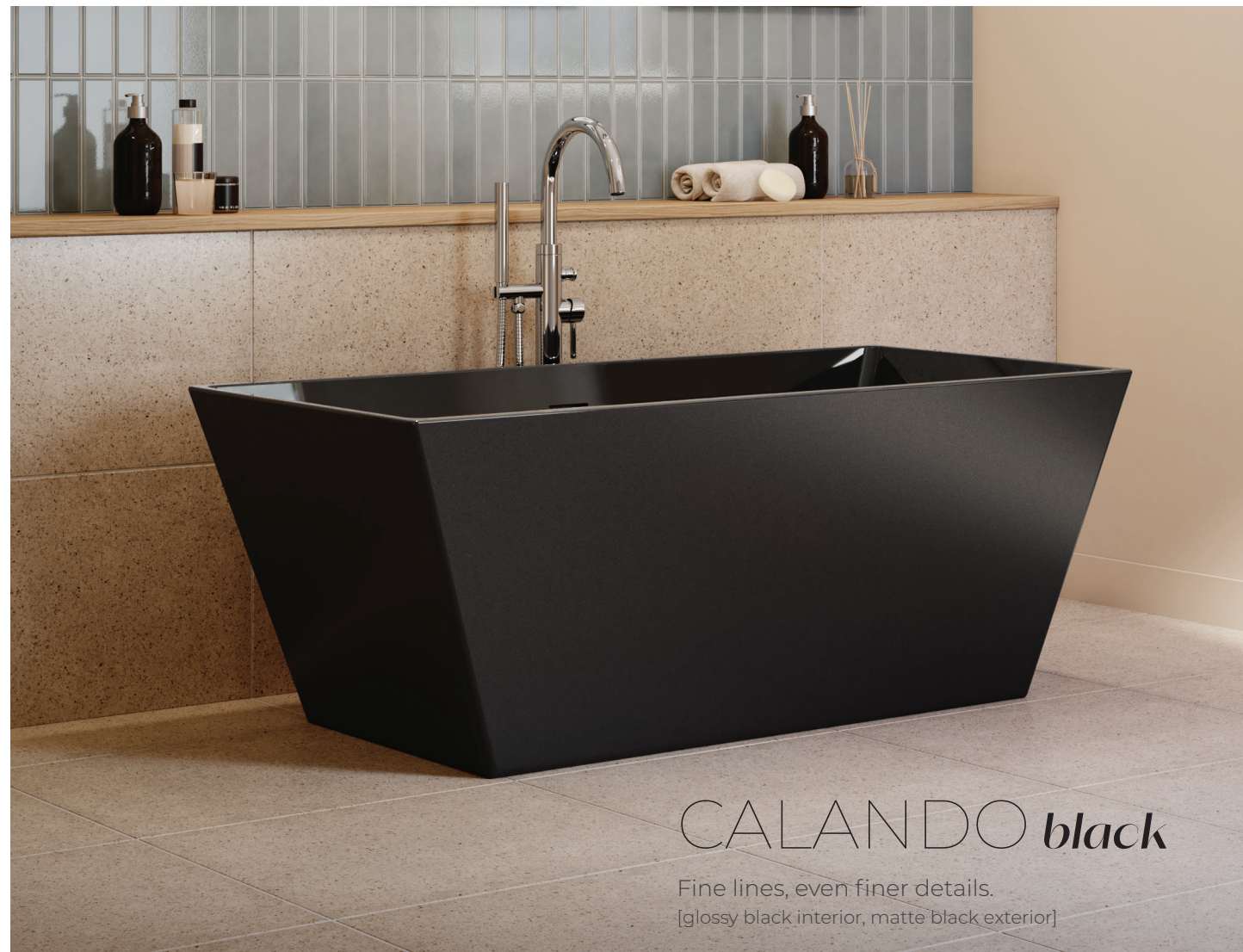
CALANDO black Fine lines, even finer details. [glossy black interior, matte black exterior]