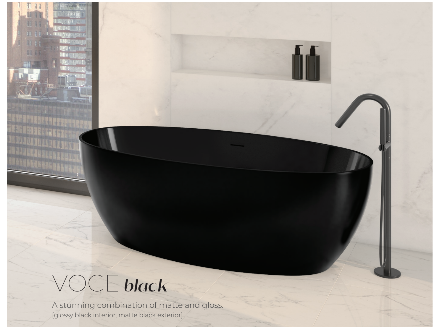
VOCE black A stunning combination of matte and gloss. [glossy black interior, matte black exterior]